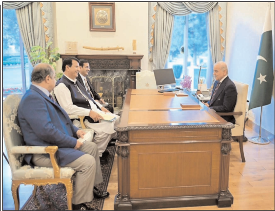
ISLAMABAD: Prime Minister Muhammad Shehbaz Sharif held meeting with Federal Minister for Azad Jammu and Kashmir and Gilgit Baltistan Amir Muqam.

The prime minister also apprised the Kuwaiti leadership of Pakistan's sincere diplomatic efforts to bring an end to the war in the Middle East. While expressing deep appreciation of the prime minister's leadership, the Crown Prince of Kuwait fully endorsed Pakistan's efforts for mediation between Iran and the U.S. He also thanked the prime minister for Pakistan's support to Kuwait in the current crisis. He thanked the prime minister for his recent letter of solidarity addressed to the Kuwaiti leadership and also expressed his desire to visit Pakistan, as soon as the situation improves.