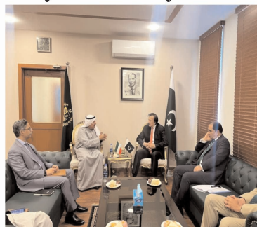
Pakistan's desire to expand business-to-business linkages and explore new investment opportunities between the two countries. Haroon Akhtar noted that

He further informed that the Prime Minister has constituted special committees to enhance food exports to Gulf countries, underscoring