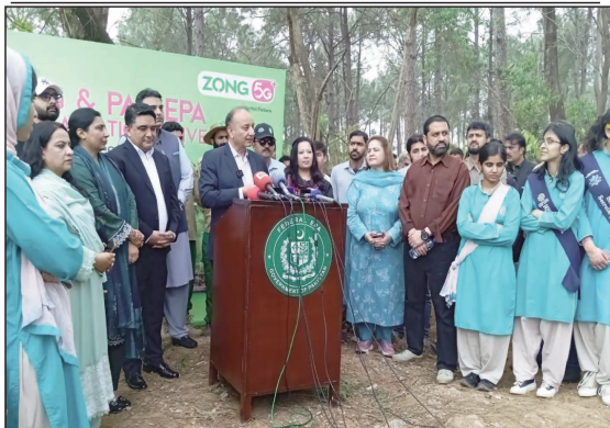
Federal Minister for Climate Change and Environmental Coordination, Dr Musadik Masood Malik, addresses a spring tree plantation drive at Shakarparian, organised by Pak-EPA Islamabad in collaboration with telecom operator Zong, Islamabad.

He also stressed the importance of involving children in environmental efforts, saying public awareness and participation in tree plantation could help build a wider culture of climate responsibility across the country.