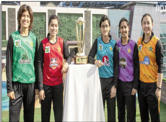
LAHORE: Captains of various team pose for a group photo during unveiling of National Women's T20 Trophy, which is beginning today (Friday) here.

The team retained players from last season still part of the lineup.