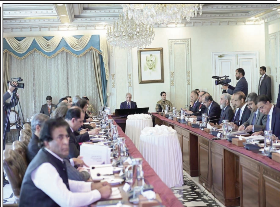
ISLAMABAD: Prime Minister Muhammad Shehbaz Sharif chairs a review meeting on exports food items to the Gulf countries and Pakistan's Maritime Operations in wake of current regional situation.

He appreciated the performance of relevant ministries and officials and instructed all departments concerned to remain in close coordination with Gulf countries regarding their food requirements. Referring to disruptions in global supply chains amid the current regional situation, the prime minister said Pakistan had a responsibility to help meet the food needs of friendly Gulf nations, adding that exports should be expedited without affecting domestic availability of essential commodities. He emphasized strict monitoring of demand and supply of food items within the country and warned that delays in decision-making at the institutional level would not be tolerated.