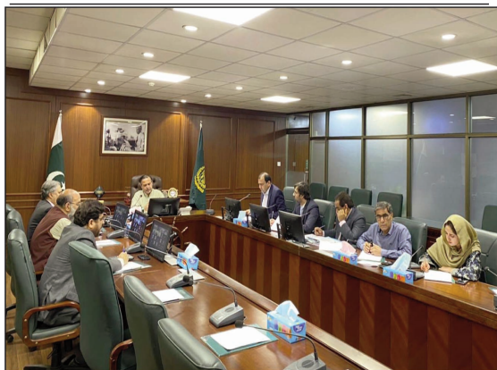
ISLAMABAD: Federal Minister of Maritime Affairs Muhammad Junaid Chaudhry chairing a meeting to discuss measures aimed at facilitating maritime trade at ports.

Kashmir (IIOJK) and subsequent cross-border escalation, underscored the NSC's critical role in facilitating civil-military consultation and coordinated national responses. The June 2025 meeting further demonstrated the NSC's capacity to assess broader regional developments, including the Israeli military strikes on Iran, highlighting its potential as a platform for strategic deliberation beyond immediate bilateral crises. PILDAT's review indicates that the NSC's overall use remained irregular. The Committee continues to function primarily as a crisis-response mechanism rather than as a regular forum for continuous.