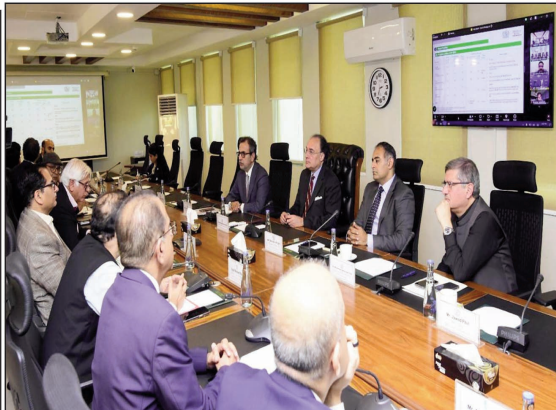
ISLAMABAD: Federal Minister for Finance and Revenue, Senator Muhammad Aurangzeb, chairing a meeting of the committee to Monitor Petrol Prices to review national fuel stocks and global market developments at the Finance Division.