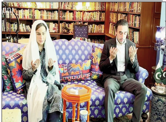
KARACHI: Chairman, Pakistan People's Party Bilawal Bhutto offering Fataha for departed soul of the senator Sherry Rehman's Daughter here on Tuesday.

Khyber Pakhtunkhwa Sohail Afridi. Sources stated that both Pakistan and the world are currently passing through a difficult period, and instead of forming a task force, the option of negotiations should be adopted. The senior leadership further advised that if an attempt is made to march towards Islamabad this time, the party could face serious damage. The leadership said that choosing the path of protest in the current situation would not be a wise decision. They added that the role of a task force would ultimately revolve around protests, and under present circumstances, protests are not suitable for party workers. It is worth mentioning that Chief Minister Khyber Pakhtunkhwa Sohail Afridi.