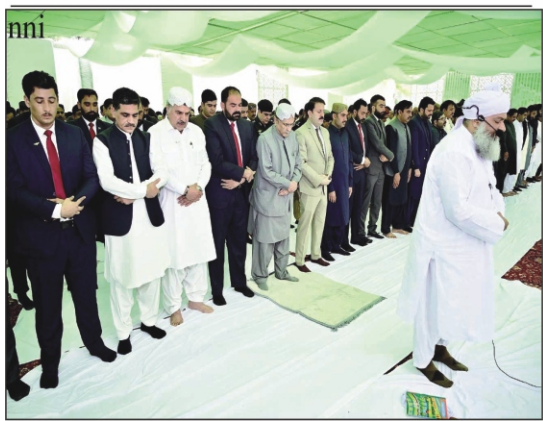
ISLAMABAD: President Asif Ali Zardari offering Eid ul Fitr prayers at Zardari House.

He stressed that both the state and society must play their role in ensuring the welfare and better future of such children.