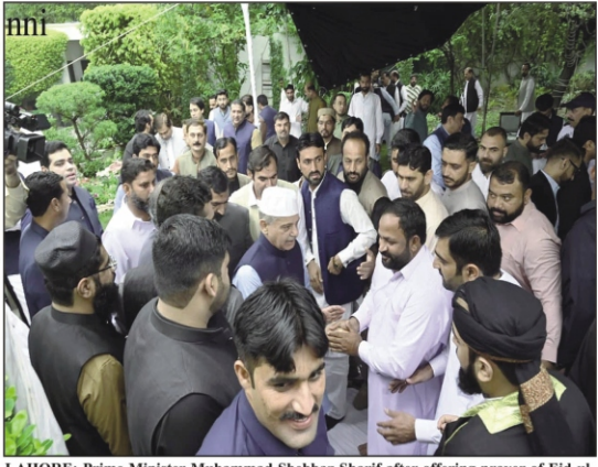
LAHORE: Prime Minister Muhammad Shehbaz Sharif after offering prayer of Eid-ul-Fitr greeting people.