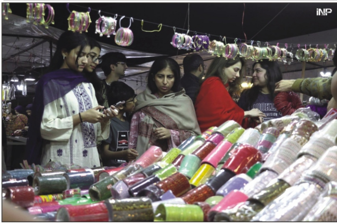
ISLAMABAD: Women busy in selecting purchasing bangles from stall for Eid ul Fitr.

izens and manage traffic effectively during the festive days. He said that special help desks have also been established in markets to assist citizens, while student volunteers would be deployed at different locations to facilitate the public and ensure implementation of traffic rules. The official added that indiscriminate crackdown would be launched against one-wheeling and hooliganism on public roads during Chand Raat and Eid days. Chief Traffic Officer Captain (R) Hamza Humayun would personally supervise all arrangements to ensure effective implementation of the traffic plan. He urged citizens to park their vehicles only in designated parking areas and cooperate with the traffic police to avoid inconvenience.