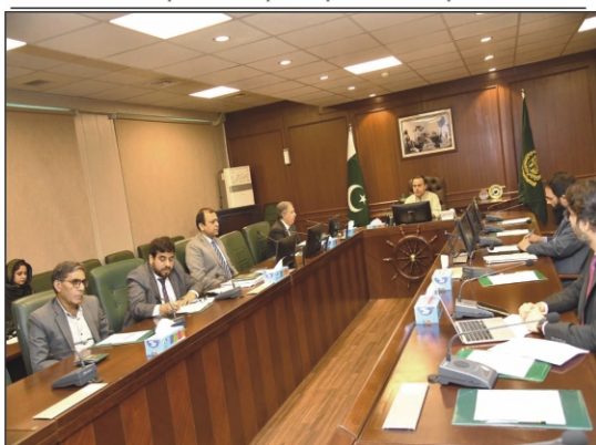
ISLAMABAD: Federal Minister for Maritime Affairs, Muhammad Junaid Anwar Chaudhry chairing a meeting to announce incentives for transshipment vessels.

He stressed the importance of achieving the target of completing comprehensive household surveys and enrollment of out-of-school children within the next three months. He further highlighted that the initiative includes community outreach.