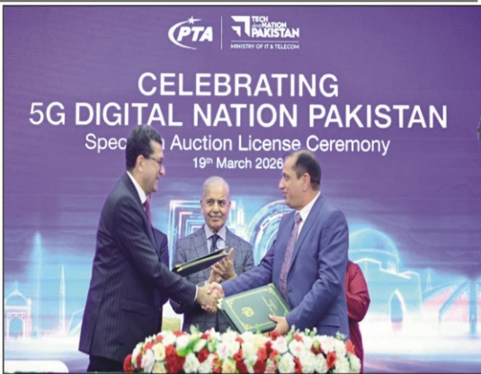
ISLAMABAD: Prime Minister Muhammad Shehbaz Sharif witnesses Spectrum Auction License Ceremony.

In a press release, Jazz announced that in the first phase of 5G rollout, the services were being provided across 180 sites in Islamabad, all four provincial capitals — Lahore, Karachi, Peshawar and Quetta — as well as in Rawalpindi, Multan and Faisalabad. "Jazz is delivering ultra-fast speeds, low latency, and enhanced reliability at scale. At the same time, Jazz continues to expand and upgrade its nationwide 4G network, ensuring that the benefits of connectivity reach every Pakistani, everywhere," the press release stated.