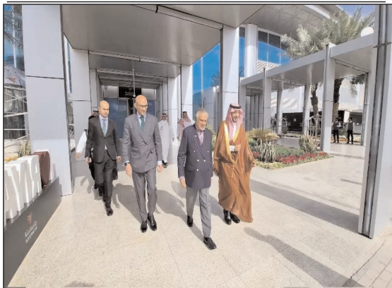
Deputy Prime Minister and Foreign Minister Ishaq Dar arrived in the Saudi Arabian capital Riyadh.

This will mark the third visit from the Pakistani side to Saudi Arabia amid ongoing tensions in the Middle East.