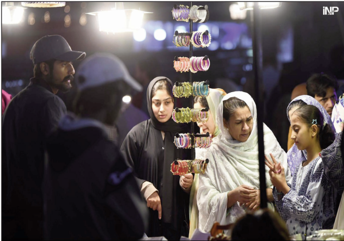
ISLAMABAD: Girls busy in selecting & purchasing bangles' from stall for Eid-ul-Fitr festival at Saddar.