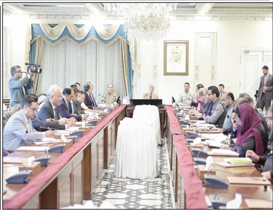
ISLAMABAD: Prime Minister Muhammad Shehbaz Sharif chairs a meeting on the matters related to Federal Ministry of Housing and Works.

tax structure related to the construction sector. "Consultations between the Federal Board of Revenue (FBR) and the provinces are ongoing regarding tax standardization for the construction industry, and discussions are also underway on draft reforms concerning housing mortgages," the meeting was told. The meeting was further informed that a framework was being prepared for the construction of homes for low-income groups under Public-Private Partnership (PPP). The briefing added that a Real Estate Regulatory Authority will be established to regulate the real estate and housing sectors. "Regarding housing finance, the Ministry of Finance, FBR, the Securities and Exchange Commission, and provincial governments are working together with the Ministry.