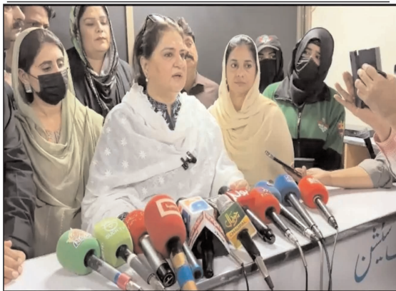
Benazir Income Support Programme Chairperson Senator Rubina Khalid talks to media during her visit to Sheikh Zayed Hospital in Rahim Yar Khan.

The BISP chairperson said the women who suffered minor injuries had been discharged from the hospital, while 17 women had suffered major injuries. One of the injured was in a serious condition, she said. She said cheques of Rs1 million and Rs300,000 were being distributed.