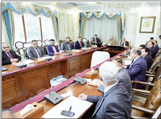
ISLAMABAD: Prime Minister Muhammad Shehbaz Sharif a review meeting regarding implementation of Austerity measures in the wake of the current regional and global situation.

The prime minister directed the Minister for Petroleum to further enhance efforts to improve Pakistan's petroleum import supply chain. He stressed that all relevant institutions should remain prepared for emergency measures until the situation improved. The meeting was attended by Deputy Prime Minister and Foreign Minister Ishaq Dar, Minister for Economic Affairs Ahmad Khan Cheema, Minister for Finance and Revenue Muhammad Aurangzeb; Minister for Petroleum Ali Pervaiz Malik, Minister for Information and Broadcasting Attaullah Tarar, Minister for Climate Change Dr. Musadik Malik, Minister for Information Technology.