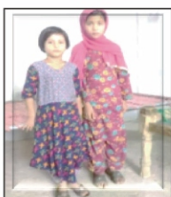
stars now watched over my silence.

In my mountain village in Khyber Pakhtunkhwa, I used to wake with the first call to prayer. Life before my father's death feels like someone else's story now. My father would walk me to school every morning, telling me stories along the path. In the evening, he would hug me tight and call me "his scholar."