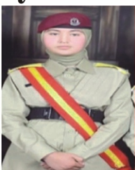
My father said every star is a fulfilled dream. You can help make someone's dream shine.

A uniform. A book. A pen. These simple things rewrite futures.