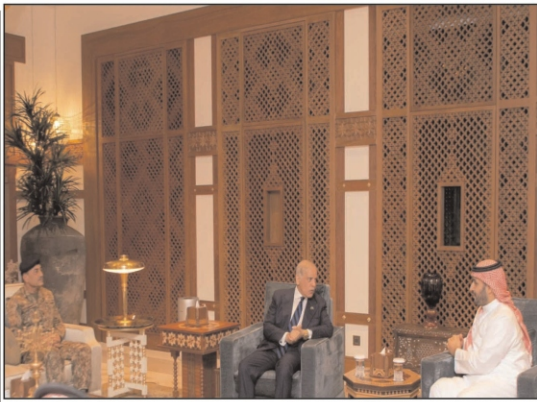
Chief of Army Staff General Syed Asim Munir and Prime Minister Muhammad Shehbaz Sharif meets the Crown Prince and Prime Minister of Saudi Arabia H.R.H Prince Muhammad bin Salman in Jeddah.

Saudi leadership for their continued support to Pakistan, particularly during challenging economic times. He reiterated Pakistan's commitment to further strengthening cooperation in key sectors such as energy, infrastructure, and investment. Chief of Army Staff General Syed Asim Munir also discussed defense collaboration and regional security with Saudi officials, highlighting the strong military-military ties between the two countries. The Pakistani delegation underscored the importance of enhancing the strategic partnership with Saudi Arabia and reaffirmed Pakistan's commitment to promoting peace and stability in the region.