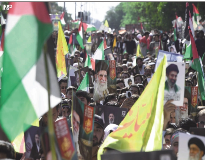
ISLAMABAD: Activates of MWM hold rally on the occasion of International Quds Day.

The IGP Rizvi reiterated that ensuring the protection of citizens' lives and property remained the top priority of Islamabad Police.