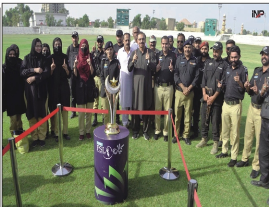
HYDERABAD: 11th PSL Trophy unveiled at Niaz Stadium Hyderabad.