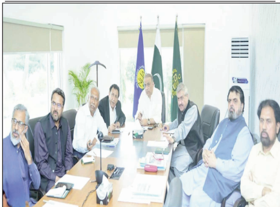
ISLAMABAD: A high level meeting of National Highway Authority chaired by Federal Minister for Communications Abdul Aleem Khan.

He pointed out that such infrastructure presents a massive opportunity for foreign investment in the hospitality sector. Consequently, he directed the NHA.