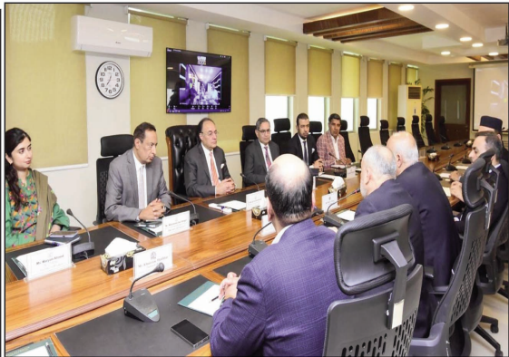
ISLAMABAD: Federal Minister for Finance and Revenue, Senator Muhammad Aurangzeb, meeting with a delegation of leading textile exporters and industry stakeholders led by Haroon Sharif, Chairman of the Pakistan Regional Economic Forum, at the Finance Division.

"He emphasised that Pakistan must gradually move towards a more balanced financial system where capital markets complement the banking sector in meeting the financing needs of the economy," the press release said. The finance minister noted that the development of a vibrant corporate bond market would play a critical role in mobilising.