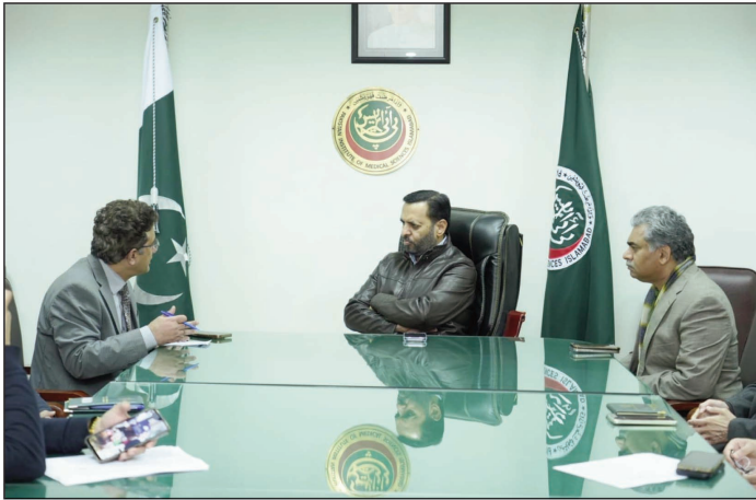
ISLAMABAD: Federal Minister for Health Mustafa Kamal visited PIMS and Polyclinic Hospital to inquire after those injured in the Islamabad suicide blast and reviewed the medical facilities being provided to the patients.