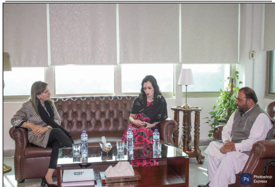
ISLAMABAD: Federal Minister for National Heritage and Culture Aurangzeb Khan Khichi meets British-Pakistani politician and Alba party chairman Tasmina Ahmed-Sheikh to discuss strengthening Pakistan-UK cultural cooperation and engaging overseas Pakistani youth with their cultural heritage.

Commissioner, while addressing the gathering, highlighted the urgent necessity of peaceful resolution of the internationally recognized dispute of Jammu & Kashmir. He reassured the audience that Government of Pakistan will continue to extend full moral, diplomatic and political support to the just struggle of Kashmiris for realization of their inalienable right to self-determination.