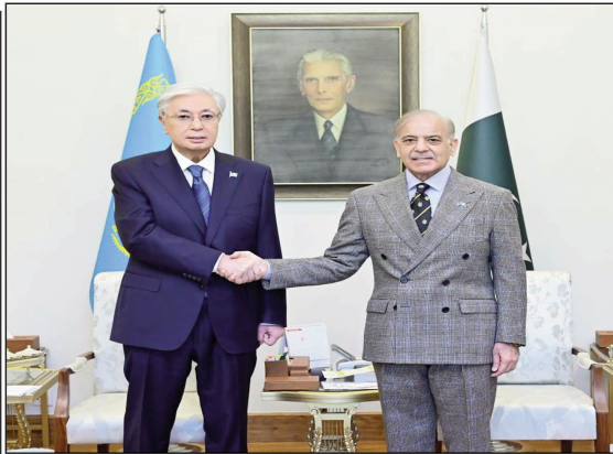
ISLAMABAD: Prime Minister Muhammad Shehbaz Sharif receiving H.E. Mr Kassym-Jomart Tokayev, President of the Republic of Kazakhstan before bilateral talks at Prime Minister House.

Separately, Federal Minister for Commerce Jam Kamal Khan met with Kazakhstan's Minister of Trade and Integration Arman Shaqaliev to discuss expanding economic cooperation.