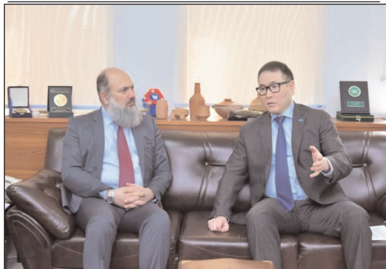
ISLAMABAD: Federal Minister for Commerce Jam Kamal Khan held a comprehensive bilateral meeting with Arman Shaqaliev, Minister of Trade and Integration of the Republic of Kazakhstan.