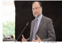
ISLAMABAD: Federal Minister for Planning, Development and Special Initiatives Professor Ahsan Iqbal on Wednesday said Pakistan has the capacity to become the world's leading dairy producer if productivity gaps and supply chain weaknesses were addressed through technology, better management and value addition.

"Pakistan is the fourth largest milk-producing country in the world, but our average dairy yield is around 1,800 to 2,000 litres, whereas leading