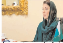
her commitment to the district alongside initiatives in law and order, Suthra Punjab, and recruitment in the Border Military Police. Provincial Minister for Transport Bilal Akbar Khan briefed the audience that 15 electric buses are now operating on three routes in Rajanpur, including Rajanpur-Fazilpur, Rajanpur-Kot Mithan, and the city circular road.

Provincial Minister for Mines Sher Ali Gorchani thanked the chief minister on behalf of the people of Rajanpur, highlighting