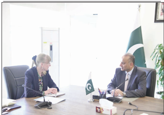
ISLAMABAD: Her Excellency Ms. Ina Lepel, Ambassador of the Federal Republic of Germany to Pakistan, called on the Federal Minister for Climate Change and Environmental Coordination, Dr Musadik Malik.

Both sides also discussed expanding the scope of bilateral cooperation, including joint research programmes, student and faculty exchanges, and strengthened institutional collaboration in climate-related areas.