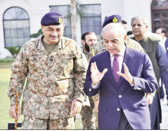
RAWALPINDI: Prime Minister Muhammad Shehbaz Sharif is being briefed on the Pakistan-Afghanistan situation by the Military leadership.

al Khwarij and its malicious actions. "The actions of the Afghan Taliban regime and Fitna al Khwarij against Pakistan are unacceptable," he said. He added that the country's armed forces, under the leadership of Chief of Defence Forces Asim Munir, were always ready to defend the country. "Pakistan knows how to defend itself against any aggression," he asserted. The premier also praised the professional capabilities of the armed forces for repelling attacks by the Afghan Taliban regime in the border areas and for retaliating vigorously. "The entire nation stands with the armed forces for protecting the homeland," he said.