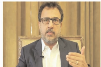
ISLAMABAD: The federal government has approved a comprehensive battery-backed power solution for Gwadar aimed at ensuring uninterrupted electricity supply to the port city by February or March next year, the Senate was informed on Friday.

Responding to a question raised by Senator Jan Muhammad, Minister for Power Sardar Awais Ahmed Khan Leghari said the newly approved arrangement would guarantee "100 per cent reliable electricity" to Gwadar's critical grids, including the deep-sea port, desalination facilities and industrial zones. The minister said the decision was taken on the directions of the prime minister after an