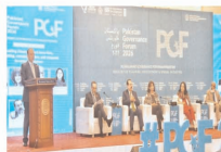
climate risks: Musadik Malik

Speaking at the Pakistan Governance Forum 2026 held at a local hotel in Islamabad, the minister said the prime minister had provided clear policy direction on technological development and that related proposals had been consolidated accordingly. Pakistan yet to deploy AI agents; inclusive tech policy needed amid