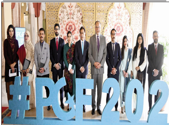
ISLAMABAD: Speaker National Assembly Sardar Ayaz Sadiq in a group photo with participants of Pakistan Governance Forum 2026.

ing and distributing meals to beneficiaries. One volunteer recalled that after taking part in the activity last year his outlook on life changed for the better. He said the happiness that comes from making life easier for others cannot be matched and that the experience deepened his sense of humility and gratitude. Members of civil society welcomed the outreach, noting that such Ramadan Iftar efforts reinforce values of brotherhood and mutual respect.