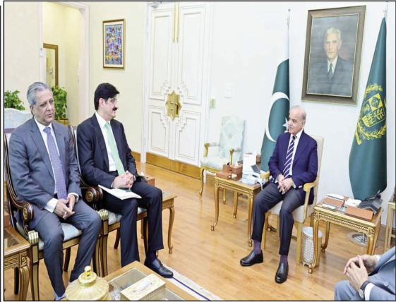
ISLAMABAD: Chief Minister Sindh Syed Murad Ali Shah called on Prime Minister Muhammad Shehbaz Sharif.

the Pakistan Peoples Party is an important ally of the federal government and emphasized that national development could be further accelerated through cooperation among coalition partners. He noted that harmony and consultation among allied parties were essential for national stability and continuity of policies. Appreciating Sindh's leadership as a key partner in the coalition government, the prime minister said strong coordination between the federation and provinces would strengthen the democratic system and help address public issues effectively. Matters relating to Sindh's political situation and other issues of mutual interest also came under discussion. Deputy Prime Minister and Foreign Minister Ishaq Dar, Federal Ministers Azam Nazeer Tarar and Ahsan Iqbal.