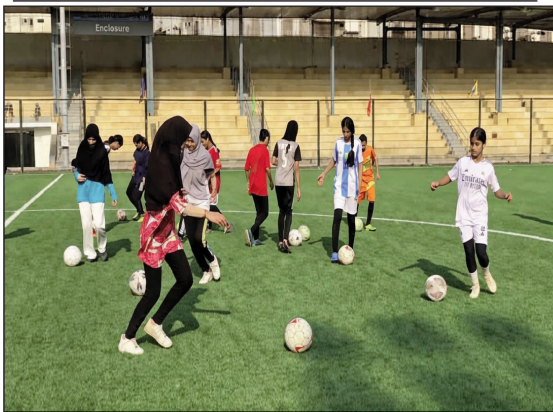
KARACHI: Female footballer attend practice camp in Leyari Football Ground here on Monday.