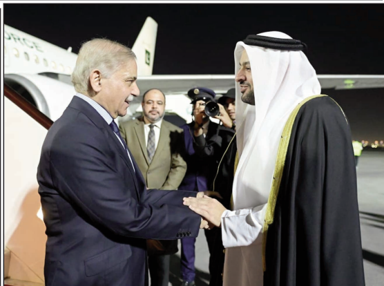
DOHA: Prime Minister Muhammad Shehbaz Sharif is being received by Minister of State for Foreign Affairs of State of Qatar, H.E Dr Muhammad bin Abdulaziz Al-Khulaifi at King Hammad International Airport, as he arrives in Qatar on two day official visit.

The Prime Minister's visit reflects the deep brotherly ties between the two countries and highlights their shared commitment to further strengthen multilateral cooperation.