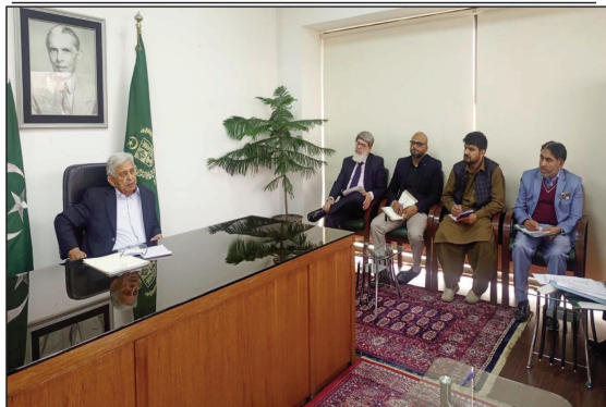
ISLAMABAD: Federal Minister for National Food Security and Research Rana Tanveer Hussain chairs the 6th meeting of the National Wheat Oversight Committee to review wheat procurement arrangements, stock availability, and price stability measures across the country.

Regarding the provision of health facilities to the PTI founder, he said all entitled facilities were being provided.