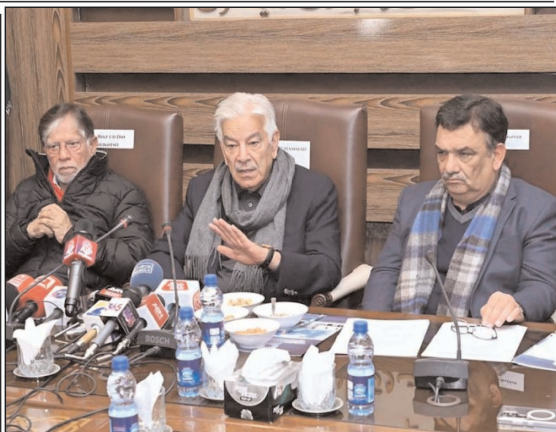
SIALKOT: Federal Minister for Defence Khawaja Muhammad Asif Addressing a press conference.

He added that India and the BLA want to push Pakistan back into economic darkness and undermine its national integrity. According to the Defence Minister, intelligence reports and confessional statements from arrested militants clearly indicate.