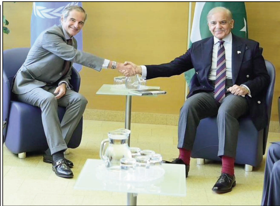
VIENNA: Prime Minister Muhammad Shehbaz Sharif met the Director General of the International Atomic Energy Agency (IAEA), Mr Rafael Mariano Grossi at the Vienna International Centre (VIC).