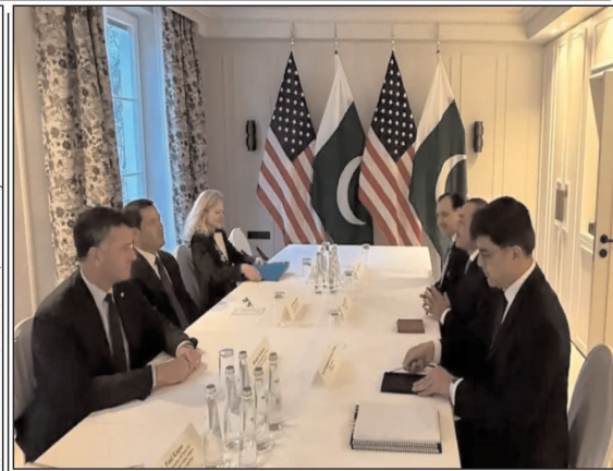
CDF and COAS Field Marshal Asim Munir meets US Secretary of State Marco Rubio in Germany.

CDF Munir also held a "productive engagement" with Brazilian Armed Forces Chief of the Joint Staff Admiral Renato Rodrigues de Aguiar Freire, the statement added. The two discussed bilateral military cooperation.