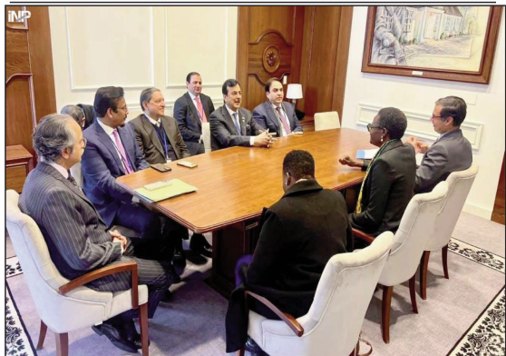
NEW YORK: Chairman Senate Yousuf Raza Gilani in a meeting with President of the Inter-Parliamentary Union (IPU) Dr Tulia Ackson during the 2026 IPU Parliamentary hearing at UN HQ.

Speaking about Pakistan's evolving cultural diplomacy, the minister detailed a comprehensive agenda that spans from international partnerships to heritage preservation and institutional reform, painting a picture of a nation ready to leverage its ancient civilizational legacy on the global stage. Beyond the Kyrgyz celebrations.