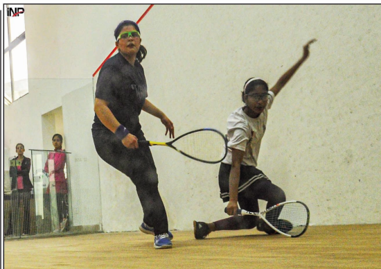
RAWALPINDI: Players in action during Rawalpindi Women's National Junior Squash Championship organized by the Rawalpindi division Squash Association at the PAF Mujahid Khan Squash Academy.