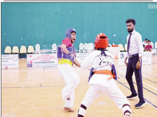
NAWABSHAH: A view of event during fifth day of the Divisional U-25 Sports Festival here on Sunday.