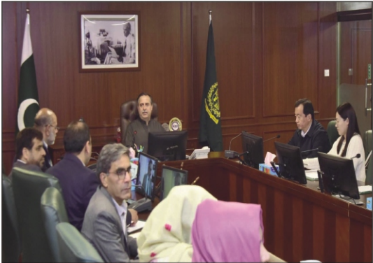
ISLAMABAD: Federal Minister for Maritime Affairs Muhammad Junaid Anwar Chaudhry chairing a high-level review meeting on the Sea-to-Steel initiative at Port Qasim.

During talks with the Russian deputy minister, both sides agreed that expanding direct land and air connectivity between Pakistan and Russia would significantly enhance regional trade and economic activity.