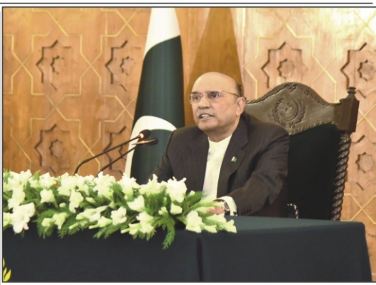
ISLAMABAD: President Asif Ali Zardari addresses the participants of the 6th International Workshop for Leadership and Stability (IWLs) during an interactive session at Aiwan-e-Sadr.

Calling the leadership and stability the pillars of nations and institutions, the presi-