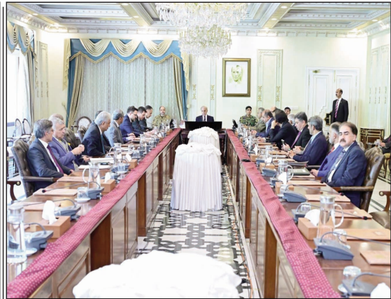
ISLAMABAD: Prime Minister Muhammad Shehbaz Sharif met with delegation of Turkish Agricultural Technologies Cluster Tume.

Türkiye in agriculture and livestock sectors. He said Pakistan was committed to modernising its agriculture sector in line with global advancements, particularly by adopting innovative technologies as successfully practiced in Türkiye's agricultural commodities and livestock sectors. "Allah Almighty has blessed Pakistan with abundant resources in the agriculture sector. We are striving to fully harness this potential through the use of modern technology and comprehensive planning," the prime minister said. He underscored the importance of enhanced bilateral cooperation to benefit from modern agricultural technologies and expertise, adding that Pakistan and Türkiye could jointly play an important role in the global food value chain.