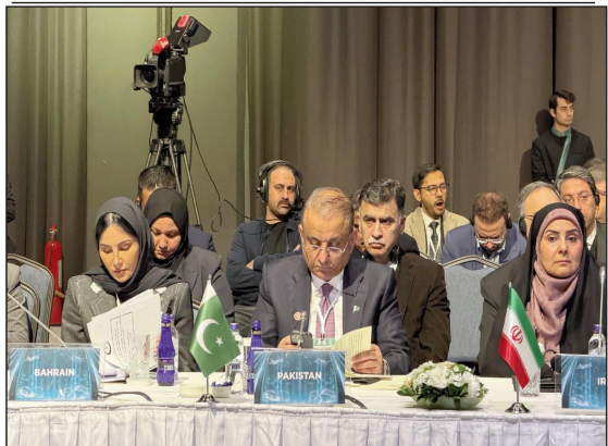
Federal Minister for Communications, Abdul Aleem Khan, addressing 2nd OIC Transport Ministers' Conference in Istanbul.

that under Pakistan Bait-ul-Mal's Individual Financial Assistance (Education) Programme, more than 75,000 students across the country have received educational support since 2004, with total expenditures exceeding PKR 2 billion. The programme, he said, has ensured continuity of education for thousands of students from economically disadvantaged backgrounds.