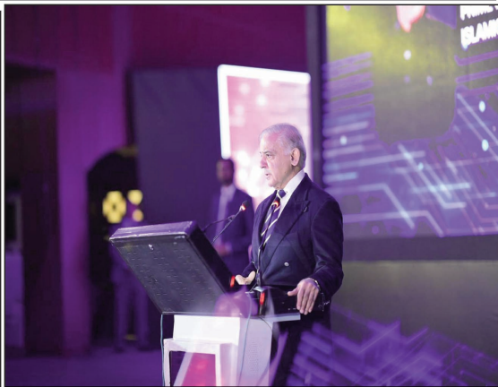
ISLAMABAD: Prime Minister Muhammad Shehbaz Sharif addresses the inaugural ceremony of AI Indus week being organized by Ministry of Information Technology.

The Prime Minister added that full digitization of the Federal Board of Revenue has enhanced transparency in tax collection, while advanced scanners and equipment have been installed at ports to curb smuggling.