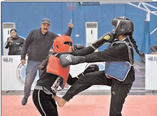
SARGODHA: Players compete in wushu trials during the "Khetla Punjab Pind Games Trials" held at a sports gymnasium, organized by the Sports Department.