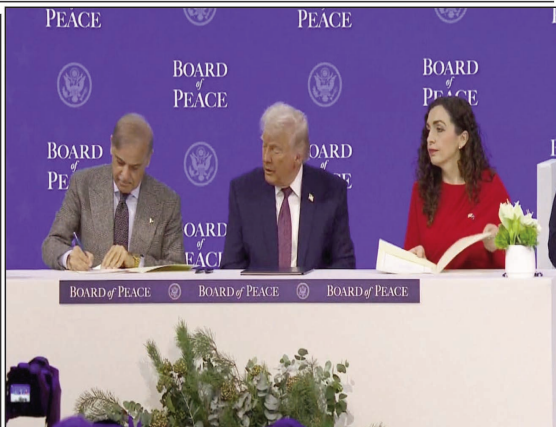
DAVOS: Prime Minister Muhammad Shehbaz Sharif signs charter of Board of Peace on the sidelines of 56th Annual meeting of the World Economic Forum.

President Trump to join the Board which was later accepted. Pakistan was among the eight Muslim states who announced to be part of the body on Wednesday which included Arab Republic of Egypt, the Hashemite Kingdom of Jordan, the United Arab Emirates, the Republic of Indonesia, the Republic of Türkiye, the Kingdom of Saudi Arabia, and the State of Qatar. It was announced that each country would sign the joining documents according to its respective relevant legal and other necessary procedures, including Egypt, Pakistan, and the UAE, that have already announced to join. Pakistan had expressed the hope that with the creation of this framework, concrete steps would be taken towards the implementation of a permanent ceasefire.