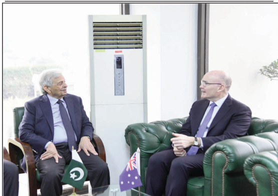
ISLAMABAD: Federal Minister for National Food Security and Research Rana Tanveer Hussain in a meeting with Australian High Commissioner to Pakistan H.E. Mr Timothy Kane to discuss Pakistan-Australia cooperation in agriculture and livestock.

Two major challenges identified were the need to establish Foot and Mouth Disease (FMD)-free zones and to improve animal weight and yield to ensure profitability for farmers. He informed the meeting that the Government of Pakistan has allocated Rs 7.35 billion for two years to control FMD, has initiated the establishment of free compartments, and is importing vaccines from Russia and China. The Minister also pointed out that Pakistan's average crop yield is around 30 maunds per acre, compared to 45 maunds per acre in India, and expressed Pakistan's desire to benefit from Australia's expertise to enhance productivity, particularly in the context of growing global food security challenges.