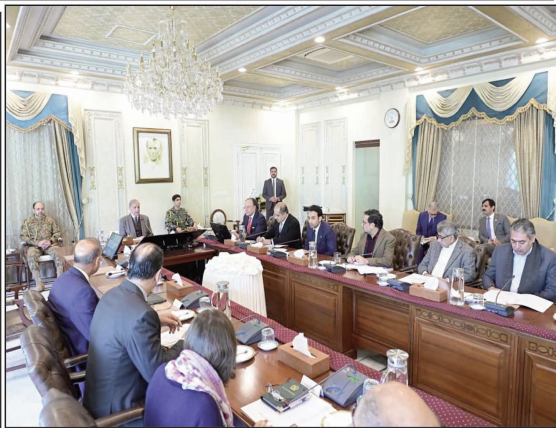
ISLAMABAD: Prime Minister Muhammad Shehbaz Sharif chairs a high level meeting on loans to SME and Agri-Sector.

Prime Minister Shehbaz Sharif said that SMEs constitute the backbone of economies and industries in developed countries.