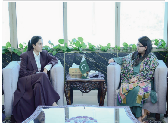
ISLAMABAD: The Sajwani business delegation of Dubai's renowned real estate company DAMAC Properties, visited the Ministry of IT and Telecom.

Federal Minister of Information Technology & Telecommunication reaffirmed the commitment to facilitate global partnerships, enable innovation.