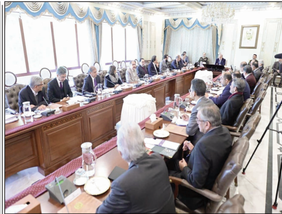
ISLAMABAD: Prime Minister Muhammad Shehbaz Sharif chairs a meeting of working group on Agriculture reforms.

provincial governments, is taking measures to promote agricultural development," the prime minister said adding that the government was taking measures to increase the per acre yield of the crops by providing farmers with standard seeds, fertilizers and pesticides timely and at affordable prices. PM Shehbaz Sharif pointed out that the government was also taking policy level steps aimed at processing of the agriculture produce to make them export-ready goods. Recently, he said the 1000 Pakistani students had been sent to China at government expenses to train them on the modern agriculture technology. Pakistan has great potential in the agriculture sector, the prime minister said adding that within available resources.