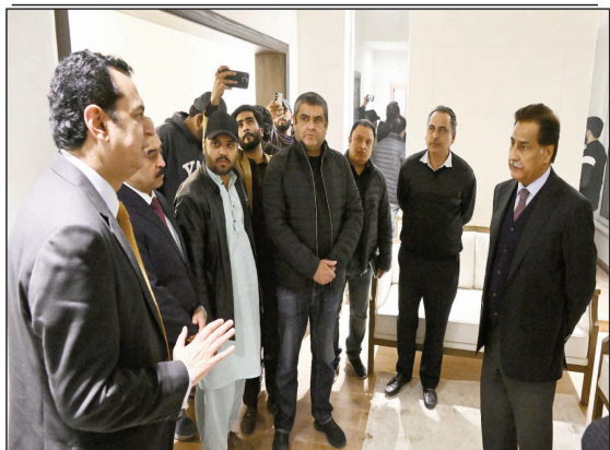
ISLAMABAD: Speaker National Assembly, Sardar Ayaz Sadiq, inspecting the construction work of the New Parliament Lodges project.

Discussions also covered cooperation between Pakistan's higher education institutions and the Higher Education Commission.