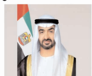
and harness their capabilities for the benefit of society.

The UAE is pioneering this innovative model as part of His Highness the President's broader vision to empower and invest in people