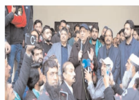
& incivility: Aleem Khan