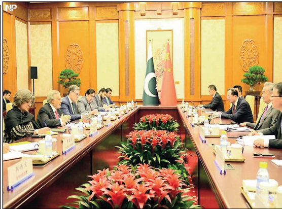
BEIJING: Deputy Prime Minister and Foreign Minister Ishaq Dar and Chinese Foreign Minister Wang Yi co-chaired the 7th round of Pak-China Foreign Ministers' Strategic Dialogue.

Earlier, the FO said Dar also met Liu Haixing, Minister of the International Department of the Communist Party of China (CPC). During the meeting, Dar congratulated the Chinese leadership on the successful convening of the fourth plenary session.