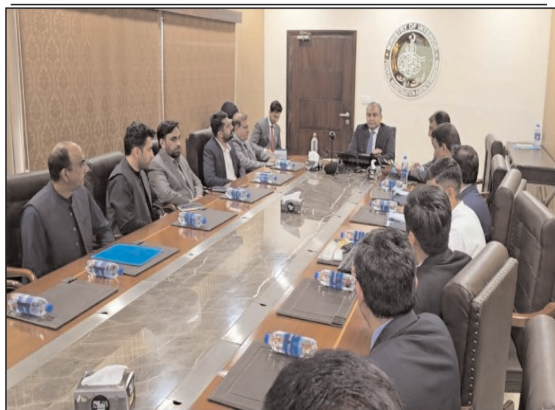
KARACHI: Federal Interior Minister Mohsin Naqvi on Sunday visited the FIA Karachi Zone and chaired a special meeting.

He said that the shortage of human resources in the FIA Karachi Zone would be addressed on a priority basis. FIA officers will be provided with all necessary resources; however, they must enhance the institution's reputation through their performance, he added. During the briefing, it was informed that over the past four months, 20 agents involved in human smuggling have been arrested, and non-custom-paid goods and drugs worth Rs. 140 million have been seized. A Facilitation Center has also been established at Karachi Airport for the convenience of passengers. The minister sought performance reports from in-charge officers regarding their respective circles and directed them to work with greater diligence. The Director, FIA Karachi Zone.