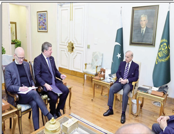
ISLAMABAD: H.E. Mr Raimundas Karoblis, Ambassador of the European Union to Pakistan, calls on Prime Minister Muhammad Shehbaz Sharif.

with the EU in all areas of mutual interest, particularly trade, investment, development, security, migration and climate change. The prime minister emphasized upon the critical role of the GSP Plus scheme in enhancing trade between Pakistan and the EU, and said the Government of Pakistan is committed to working closely with the EU on mutually beneficial trade enhancement initiatives, especially through the GSP Plus. The prime minister also expressed satisfaction at the 7th round of Pakistan-EU Strategic Dialogue held in Brussels in November last year, where the Pakistan side was led by Deputy Prime Minister & Foreign Minister Senator Mohammad Ishaq Dar. The EU Ambassador expressed his gratitude.