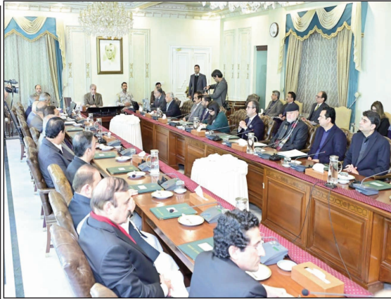
ISLAMABAD: Prime Minister Muhammad Shehbaz Sharif chairs a meeting regarding promotion of Industrial sector.

Furthermore, he described his recent meetings with President of the United Arab Emirates Sheikh Mohamed bin Zayed Al Nahyan, as extremely beneficial in the context of bilateral relations and mutual consultation. The prime minister further said that a day earlier, he had a pleasant telephone conversation with Prince Mohammed bin Salman, Crown Prince and Prime Minister of Saudi Arabia, in which satisfaction was expressed over the pace of economic and strategic relations between the two countries. The prime minister said that discussions were also held regarding further broadening.