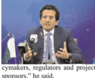
cymakers, regulators and project sponsors," he said.

"We would particularly welcome participation through a country pavilion showcasing mining capabilities, technologies and equipment. The forum will serve as a focused platform for structured engagement with poli-