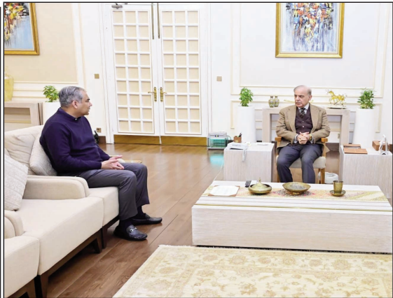
ISLAMABAD: Federal Minister for Interior Syed Mohsin Raza Naqvi called on Prime Minister Muhammad Shehbaz Sharif.

Bangladesh were replaced by Scotland on Saturday, which is scheduled to begin next month, following their refusal to tour India over safety concerns in the wake of soured political relations between the Asian neighbours.