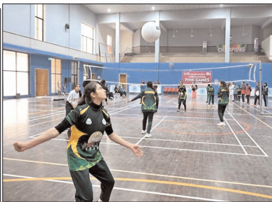
SARGODHA: Players undergo volleyball trials during the "Khetla Punjab Pind Games Trials" held at a sports gymnasium, organized by the Sports Department.