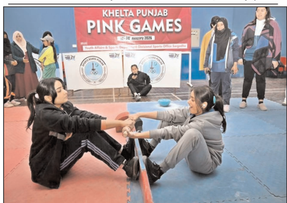
SARGODHA: Players are participating in Mass Wrestling trials during the "Khelta Punjab Pink Games," held at the Sports Gymnasium organized by the Sports Department.

Despite the significant financial loss, the cricketers have not yet filed any formal complaints or approached the Pakistan Cricket Board (PCB) regarding the issue. However, PCB Chairman Mohsin Naqvi has assured full cooperation with affected players.