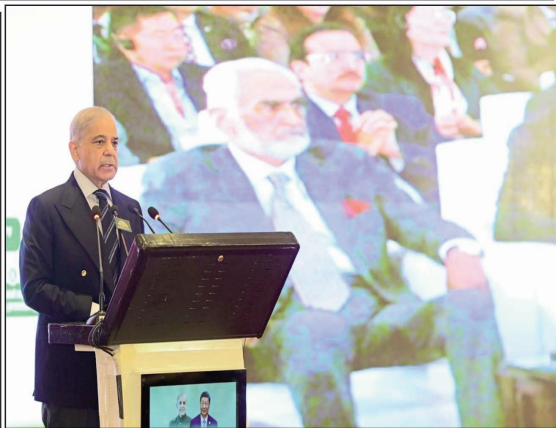
Prime Minister Muhammad Shehbaz Sharif addresses Pak-China Agri Investment Conference held in Islamabad.

He said the dispatch of 1,000 Pakistani graduates, selected on merit, to leading Chinese agricultural universities.