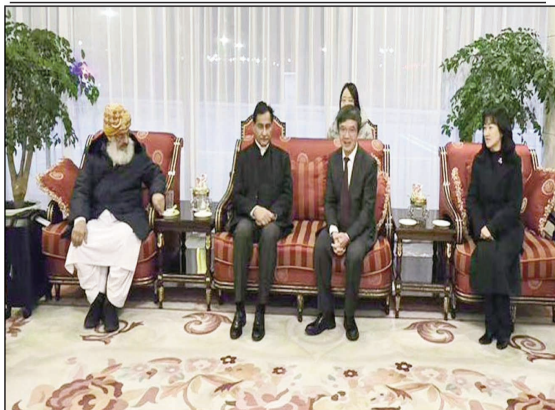
Pakistani Parliamentary delegation led by Speaker National Assembly Sardar Ayaz Sadiq arrives in Beijing China.

media at the Supreme Court today, Gohar said, "The party will take a final decision whether or not to attend future meetings of the JCP after having consultation with the PTI founder". When asked why PTI skipped meetings of the commission, Barrister Gohar explained that the status of the commission had changed after the passage of the 27th Constitutional Amendment.