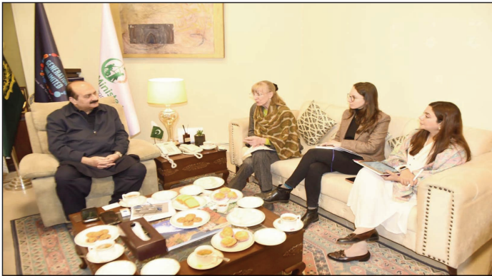
ISLAMABAD: Chairman Prime Minister's Youth Programme Rana Mashhood Ahmad Khan in a meeting with German Ambassador.