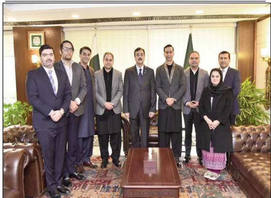
ISLAMABAD: Acting President Syed Yousuf Raza Gilani in a group photo with delegation of businessmen, traders, investors and industrialists at the Parliament House.

Regarding telecom issues at Parliament Lodges, the minister said that a survey was already under way. "If any block or area has weak service, we will verify it. The minister said that telecom services were being provided nationwide without political bias. "It is not the case that areas of our own party receive better signals while opposition areas.