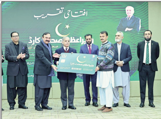
ISLAMABAD: Prime Minister Muhammad Shehbaz Sharif presenting a symbolic health card to a resident of Azad Jammu & Kashmir to mark the launch of PM's Health Card Scheme.

"Nothing is more valuable than health," the prime minister said.