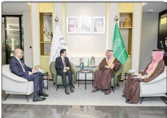
RIYADH: Federal Minister for Petroleum Ali Pervaiz Malik held a meeting with H.E. Bandar Ibrahim Al-Khorayef, Saudi Minister of Industry and Mineral Resources on the sidelines of Future Minerals Forum.

and basic health activities in far-flung regions, improving outreach and access to essential services. Highlighting the challenges facing the healthcare system, Syed Mustafa Kamal noted that any large-scale outbreak places immense pressure on the entire health infrastructure, citing the Covid-19 pandemic as an example that overwhelmed even developed nations.