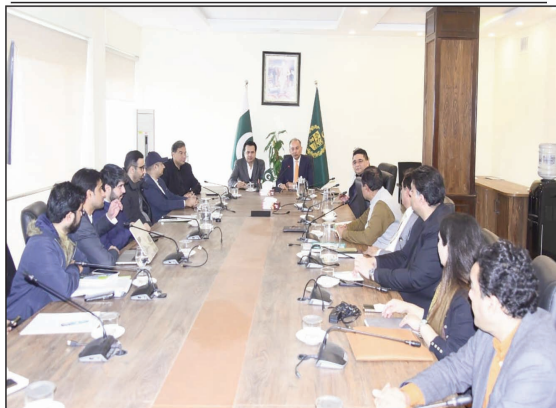
ISLAMABAD: Federal Minister for Climate Change and Environmental Coordination Dr Musadik Malik chairs a high-level meeting on Environmental Protection of Pakistan.

A comprehensive stocktaking of the current situation was conducted during the meeting, and the minister directed all stakeholders to maintain close coordination on future steps.