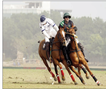
place in the tournament.

Two closely fought penalty shootouts marked the day, with teams battling for pride and final standings after finishing level on points in the league phase. In the match to decide the fourth and fifth positions, BN Polo emerged victorious over PB Polo by a narrow 4-3 margin in the penalty shootout. The contest was evenly matched throughout, but BN Polo held their nerve in the decisive moments to secure fourth