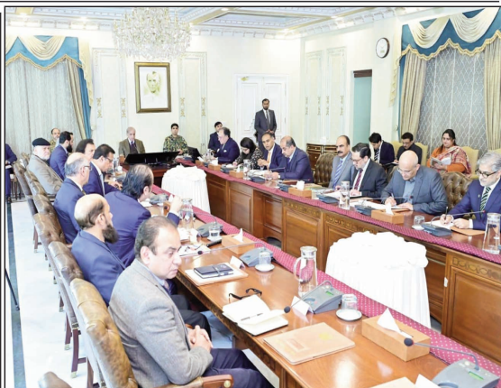
ISLAMABAD: Prime Minister Muhammad Shehbaz Sharif presiding over a meeting on Federal Government's Ramadan Package.

He said that providing subsidy amounts to the public through digital wallets will also prove to be a milestone in achieving a cashless economy. "The inclusion of the State Bank of Pakistan in the distribution.