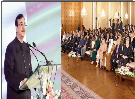
ISLAMABAD: Chairman Senate Syed Yousaf Raza Gilani delivering the keynote address at an event held at Aiwan-e-Sadr.

note of the low fund utilization, which currently stands at only 10% for Power Division projects and 6% for hydel power projects under the Water Resources Division. Ahsan Iqbal stressed that these sectors are the heavy consumers of the development budget and directed officials to expedite progress on critical projects.