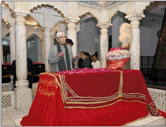
LARKANA: President Asif Ali Zardari offering fatha and laying flowers at the grave of Shaheed Zulfikar Ali Bhutto in Garhi Khuda Bakhsh.

Field Marshal Asim Munir. These visits were aimed at thanking these nations for their support during the military tensions between Pakistan and India. Pakistan-Saudi Defence Agreement: September 17 marked a major event with the signing of a historic defense agreement between Pakistan and Saudi Arabia. Prime Minister Sharif received an honor guard upon arrival, including a salute and a guard of honor, symbolizing the strong bilateral relations. White House Meeting: In September 2025, Prime Minister Sharif, along with the army chief, attended the United Nations General Assembly in New York. On September 26, they met with US President Donald Trump, a follow-up to President Trump's invitation to Field Marshal