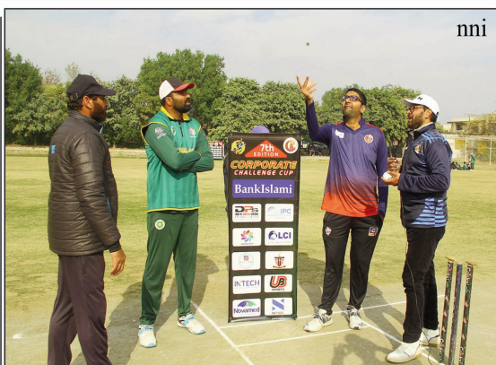
LAHORE: A view of the toss between captains of IPC and Sardar Group for Match of the 7th Edition of the Corporate Challenge Cup here on Monday.