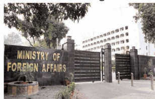
media on Sunday.

The joint statement was shared by the Spokesperson for the Ministry of Foreign Affairs Pakistan with