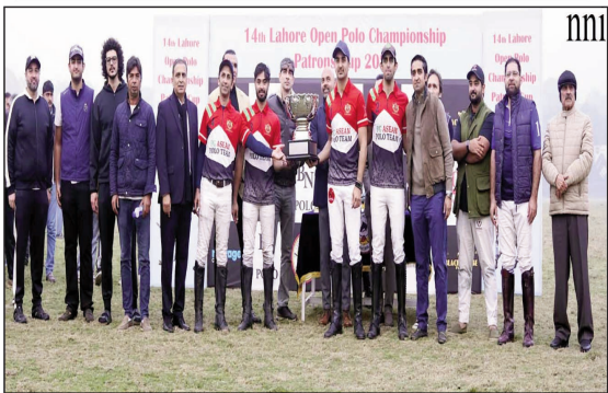
LAHORE: FG ASEAN, the Winning team of Patrons Cup Final match receiving trophy from chief guest the 14th Lahore Open Polo Championship here on Sunday.