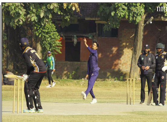
LAHORE: A view of match between teams of Uni Software and Intouch during round match of 7th Edition of Corporate Challenge Cup here on Sunday.

edly voiced concerns over transparency, governance and communication within the PSL setup. The PCB responded with legal notices, accusing him of breaching contractual obligations, while Tareen threatened counter-legal action and ultimately decided against renewing ownership, citing principles. Speaking at a press conference at Gaddafi Stadium, Naqvi said: "This year, the PCB will operate Multan Sultans itself. After the end of the next PSL season, God-willing, we will hand it over to its next owners after an auction process." He added that an "acting head" for the franchise would be appointed within the next eight to 10 days, preferably a professional cricketer to ensure smooth operations. The development coincides with the PSL's expansion to eight teams for its 2026 edition — the league's first major restructuring since Multan Sultans joined seven years ago. The auction for the two new franchises is scheduled for January 8 in Islamabad, following the shortlisting of 10 technically qualified bidders from domestic and international investors.