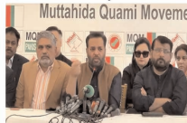
Muttahida Quami Movement

Kamal also alleged that Hussain exploited funeral proceedings for publicity and celebrated Farooq's murder on his own birthday, describing it as a