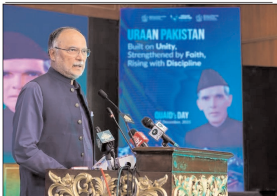
ISLAMABAD: Federal Minister for Planning, Development and Special Initiatives Professor Ahsan Iqbal Addressing a ceremony titled "Quaid's Pakistan - Uraan Pakistan" here at the Convention Centre.

Reaffirming the rights of religious freedom, Naqvi said the Christian community in Pakistan enjoys complete liberty to celebrate their religious and cultural traditions with full zeal and dignity. He praised the Christian community's remarkable contributions to education,