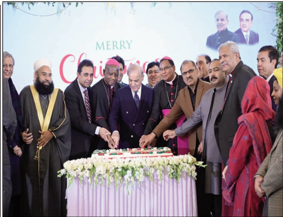
ISLAMABAD: Prime Minister Muhammad Shehbaz Sharif cuts a cake at the Christmas ceremony at PM House.