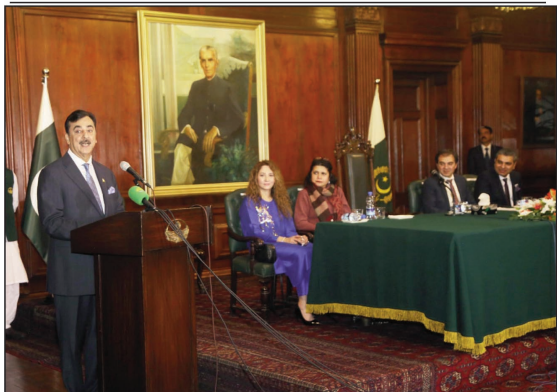
LAHORE: Acting President of Pakistan Syed Yousaf Raza Gilani addressing the medical conference of the Association of Physicians of Pakistan from North America (APPNA) as chief guest, at Governor House.