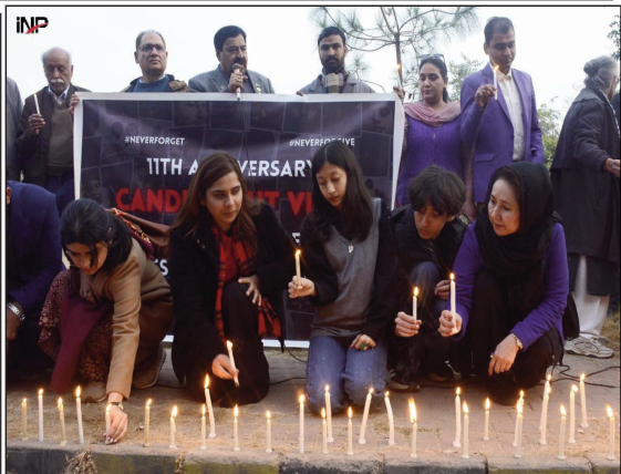
ISLAMABAD: Activists of civil society lighting candle in memory of the APS martyrs outside NPC on the 11th anniversary of the Army Public School (APS) attack.

The prime minister said that the entire nation shared the grief of the martyrs' bereaved families, and saluted their patience and resilience. "Today, as Pakistan once again faces the menace of terrorism, with security personnel and innocent civilians.